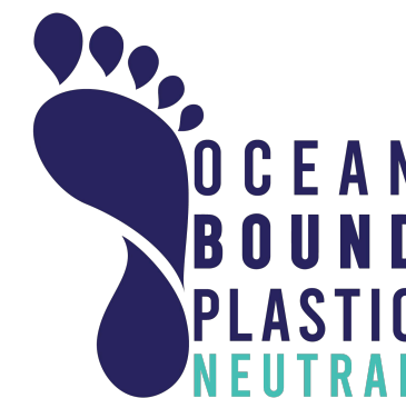
Thomas Peacock-Nazil Founder, Seven Clean Seas

This document certifies that Nomia , in partnership with Seven Clean Seas, has funded the removal of 5,000kg of plastic from marine environments and coastal areas.