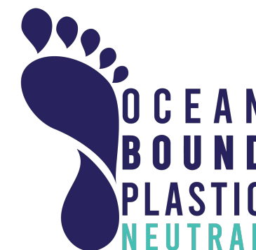
Thomas Peacock-Nazil Founder, Seven Clean Seas

This document certifies that Nomia in partnership with Seven Clean Seas, has funded the removal of 5,000kg of plastic from marine environments and coastal areas.